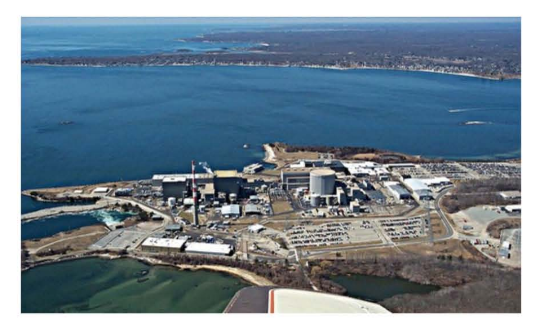
Millstone 1 Nuclear Power Plant 660 megawatts Cost $101 million 1966

Millstone 1, near New London, CT was constructed in 5 years and operated from 1970 to 1998. Two other reactors, units 2 and 3 are still operating on the site.