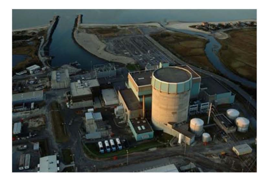
Shoreham Nuclear Power Plant 820 megawatts cost $6 billion 1973

Millstone 1, near New London, CT was constructed in 5 years and operated from 1970 to 1998. Two other reactors, units 2 and 3 are still operating on the site.